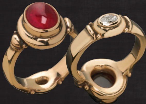
1217 hadrian ring with 4 carat ruby cabochon and .19 carat oval diamond

on the cover: 1220 constantine ring with 10.83ct orange zircon cabochon and .31 tcw oval diamonds, 824 tower ring with 1.81 carat golden sapphire and .20 tcw diamonds