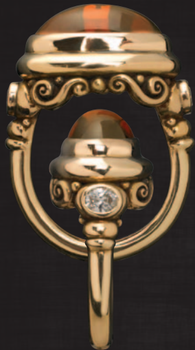
1220 constantine ring with 10.83ct orange zircon cabochon and .31 tcw oval diamonds

* Learn more about the inspiration behind these rings at webgoldsmith.com/inspire