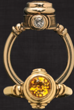
824 tower ring with 1.81 carat golden sapphire and .20 tcw diamonds