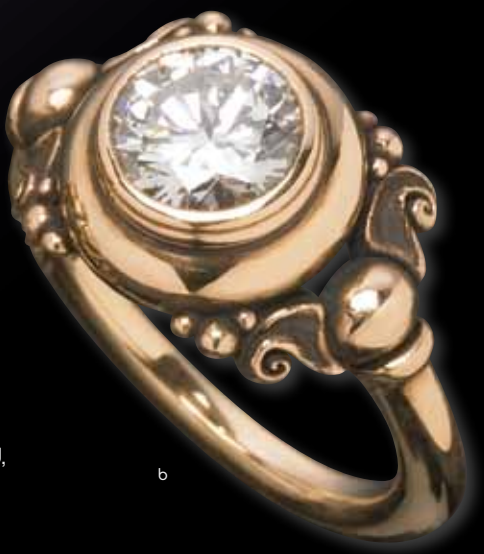
on the cover: custom ring with 1.39 ct. diamond, custom ring with green tourmaline cabochon, custom ring with 1.00 ct. honey yellow diamond & .48 t.c.w. accent diamonds