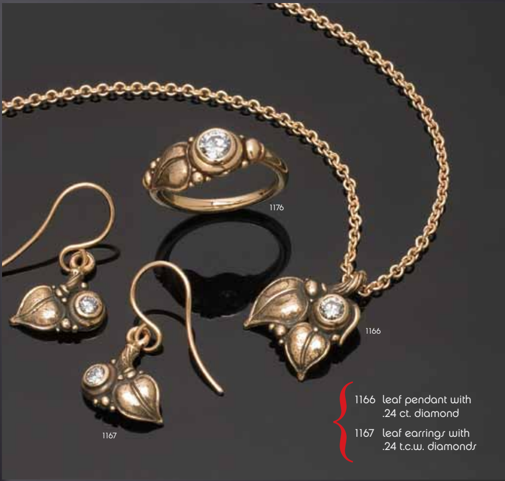
1166 leaf pendant with .24 ct. diamond 1167 leaf earrings with .24 t.c.w. diamonds