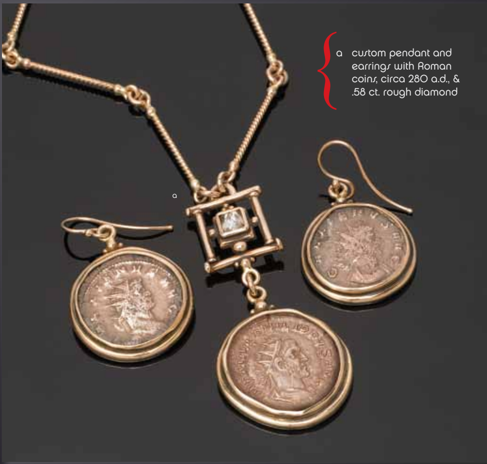
a custom pendant and earrings with Roman coins, circa 280 a.d., & .58 ct. rough diamond