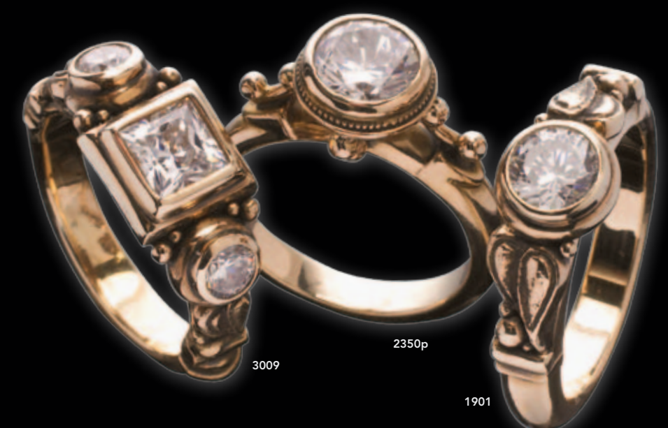
3009 sarasota, 2350p santa margarita, 1901 ann arbor

We hope you will enjoy this collection, destined to create a lifetime of memories. We thank you for your continued patronage and look forward to a future filled with new adventures and influences to bring to you.