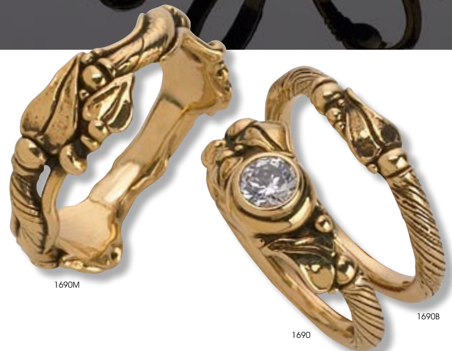
1690M 1690 1690B