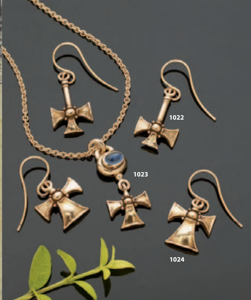
1022 Long baron earrings