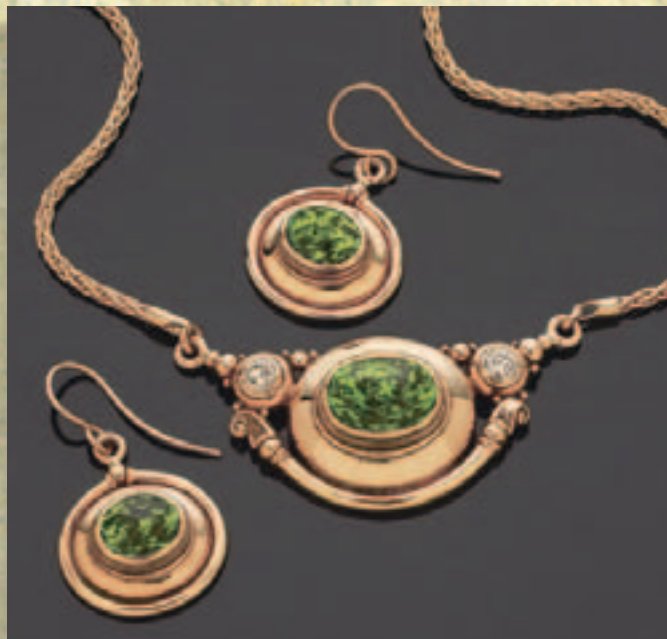
Custom peridot and diamond set