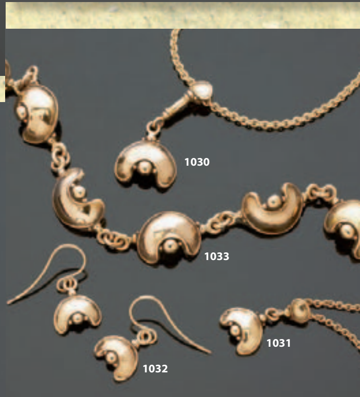
803 Cast ring with cabochon carnelian