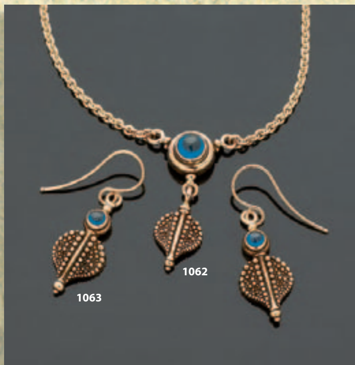
1063 Armadillo shield cast and fabricated earrings with cabochon sapphires