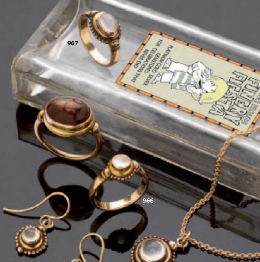
967 Oval Shangri-La ring with moonstone